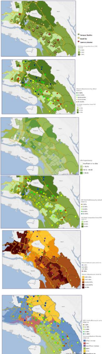
One map...many devices.